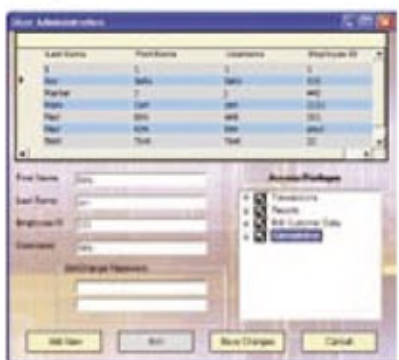
User Admin Security: GávaEL gives you complete control over access to the software. Making for a more secure program with less of a possibility for shrinkage or theft.