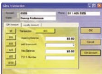
Transaction Gift: Color coded dialogs make for quick and easy processing reducing the wait at check-out to mere seconds