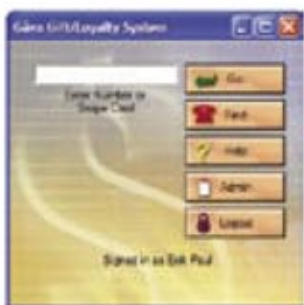
Main Menu: Easy to use and easy to learn interface completely eliminates the needs for multiple clicks, keystrokes or special codes of any kind

GávaEL makes updates a snap with SmartUpdate. Simply starting the GávaEL software insures that updates are installed and available to you. No need for your IT staff to do the work!